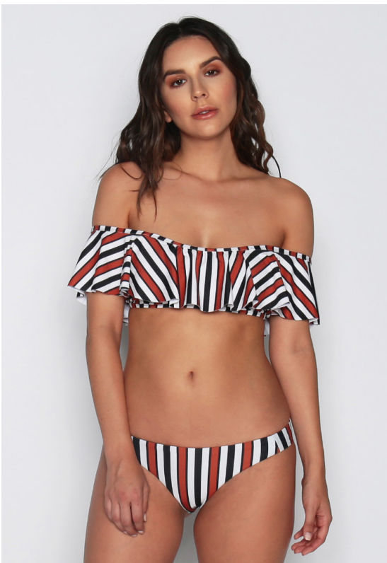
LS0913 IBIZA TOP

USA: w/s $19 msrp $38 CAN: w/s $22.50 msrp $45