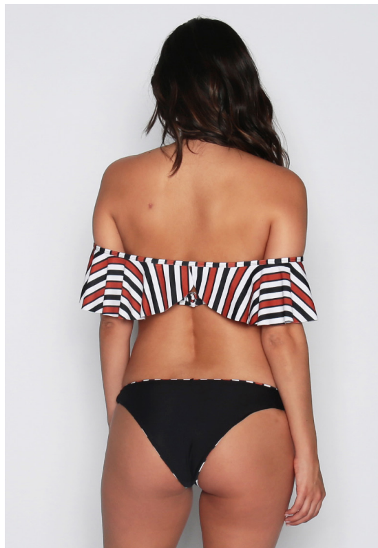
LS0915 QUINN REVERSIBLE CHEEKY BOTTOM

USA: w/s $25 msrp $50 CAN: w/s $27.50 msrp $55