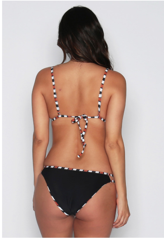
LS0914 NEELY REVERSIBLE MID BOTTOM

USA: w/s $20 msrp $40 CAN: w/s $23 msrp $46